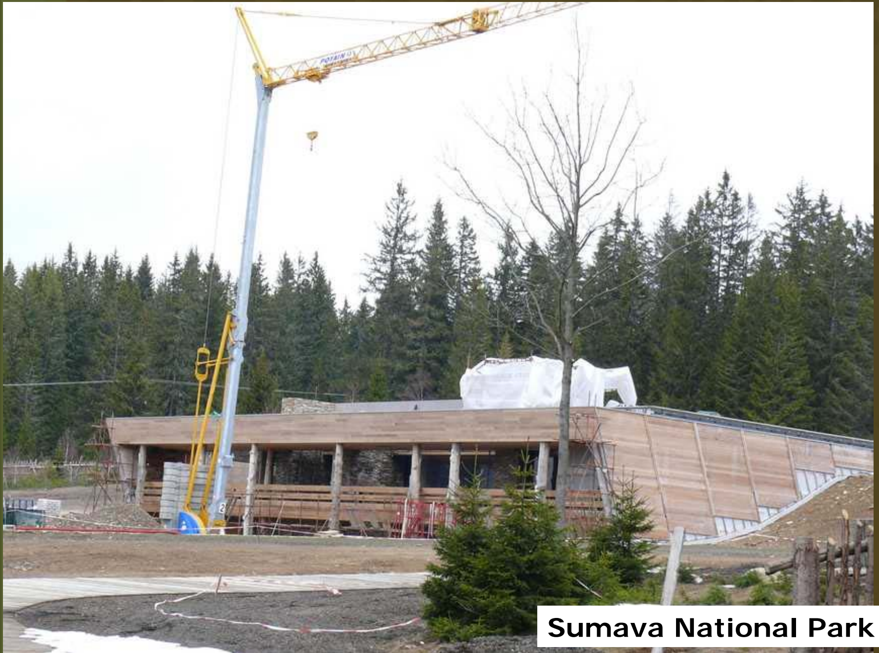
Sumava National Park