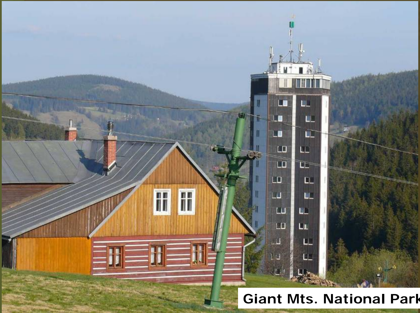
Giant Mts. National Park