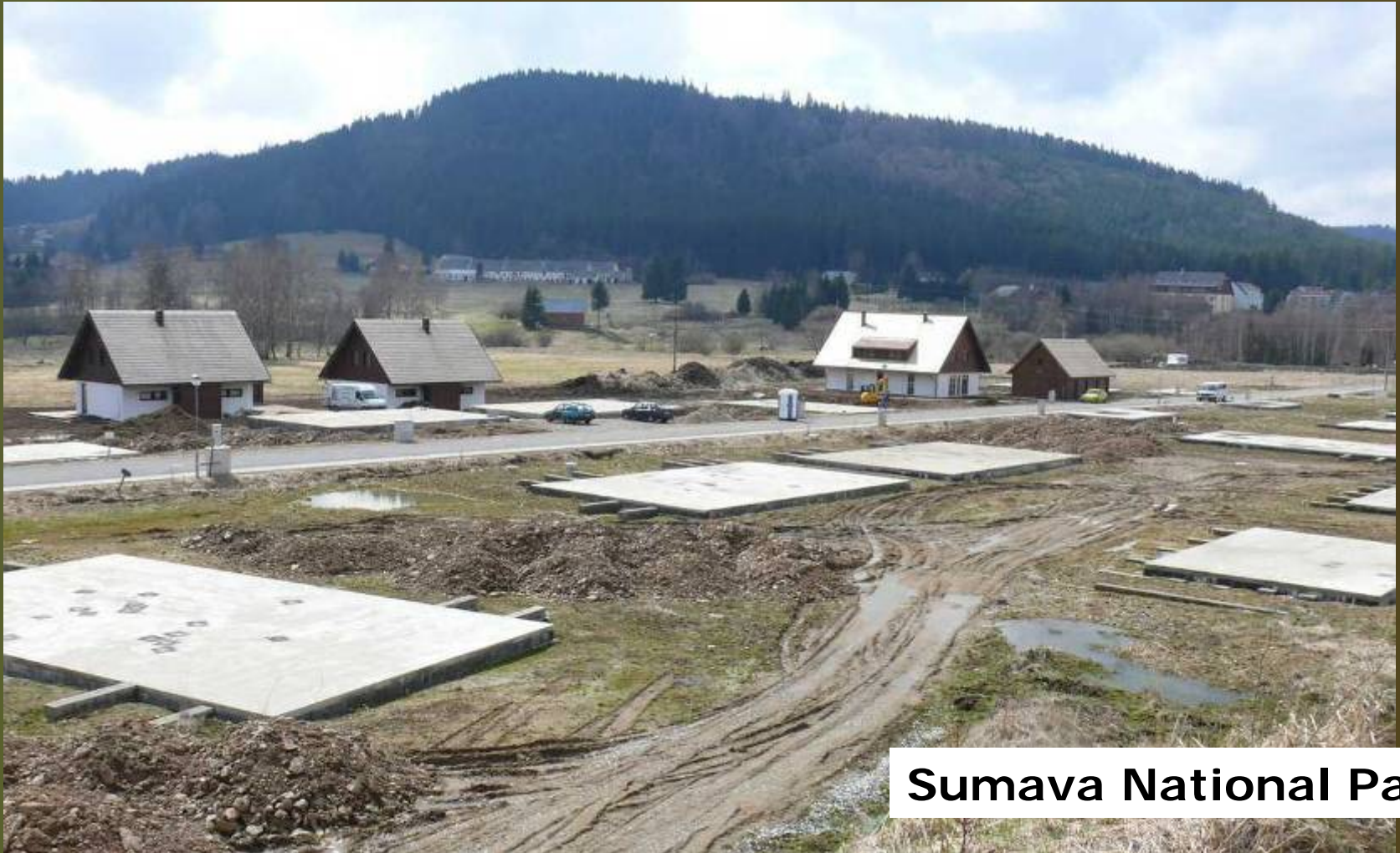
Sumava National Park